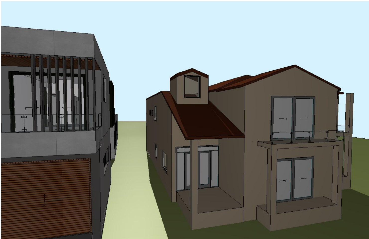
PERSPECTIVE SHADOW - 21 JUNE 11AM SCALE 1:250