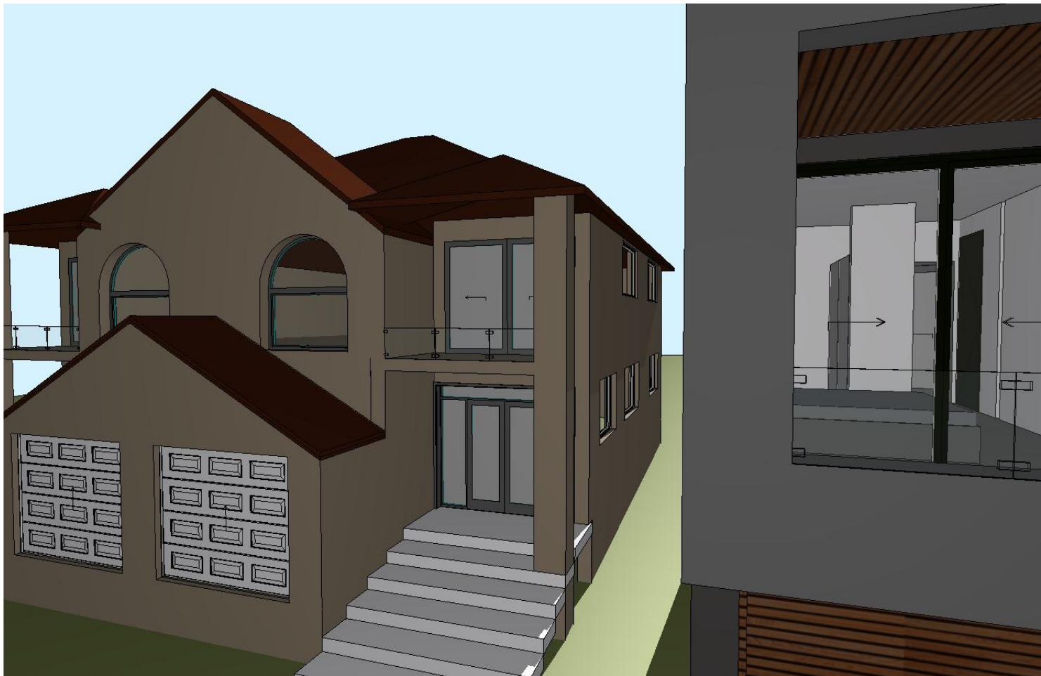
PERSPECTIVE SHADOW - 21 JUNE 11AM