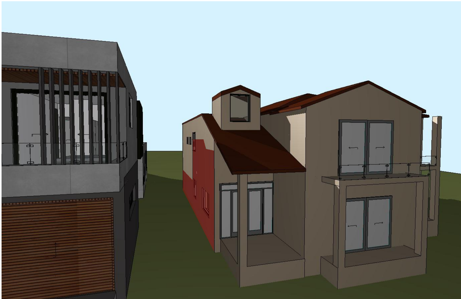
PERSPECTIVE SHADOW - 21 JUNE 2PM SCALE 1:250